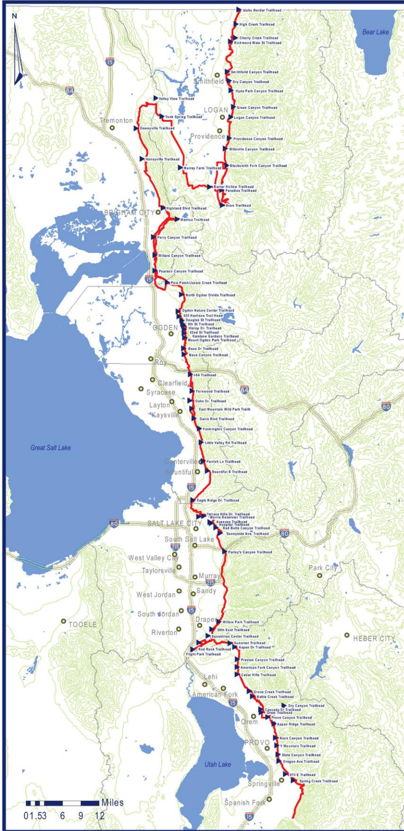
BONNEVILLE SHORELINE TRAIL